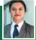
Himani Nile Syngenta