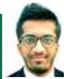
Ganesh Dukare Parle Agro