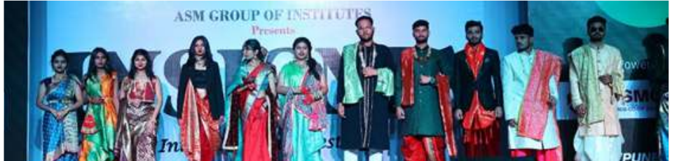
INSIGNIA FASHION SHOW