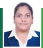
Soma Savya Meticulous Market Research