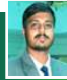
Ratnadeep Shejul Kalash Seeds